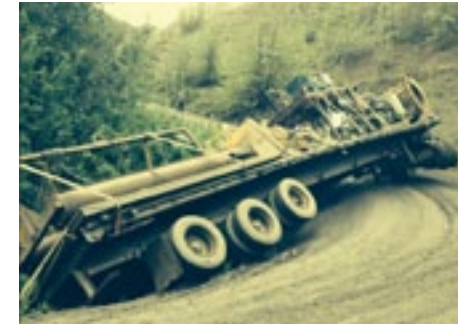
A low bed had a close call when it slipped off the road on July 29, 2014 at 10 Mile

The Tahltan Band Council passed a new resolution on August 1, 2014 that introduces new rules for permission to use Highway 51, the only road into the Tahltan community of Telegraph Creek.